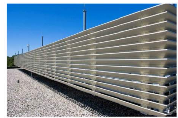
METAL SCREEN LOUVER (COLOR TO MATCH EXISTING MED BRONZE)