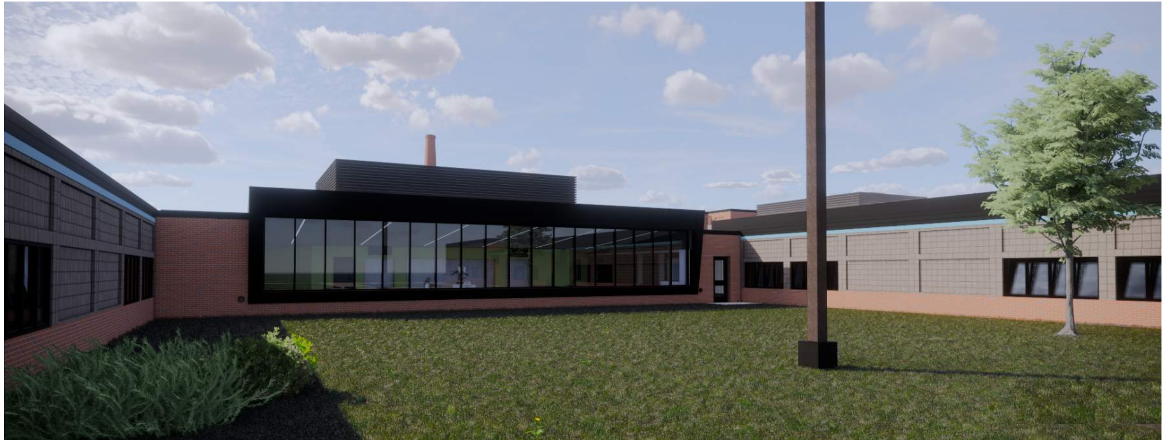
PROPOSED BUILDING ADDITION