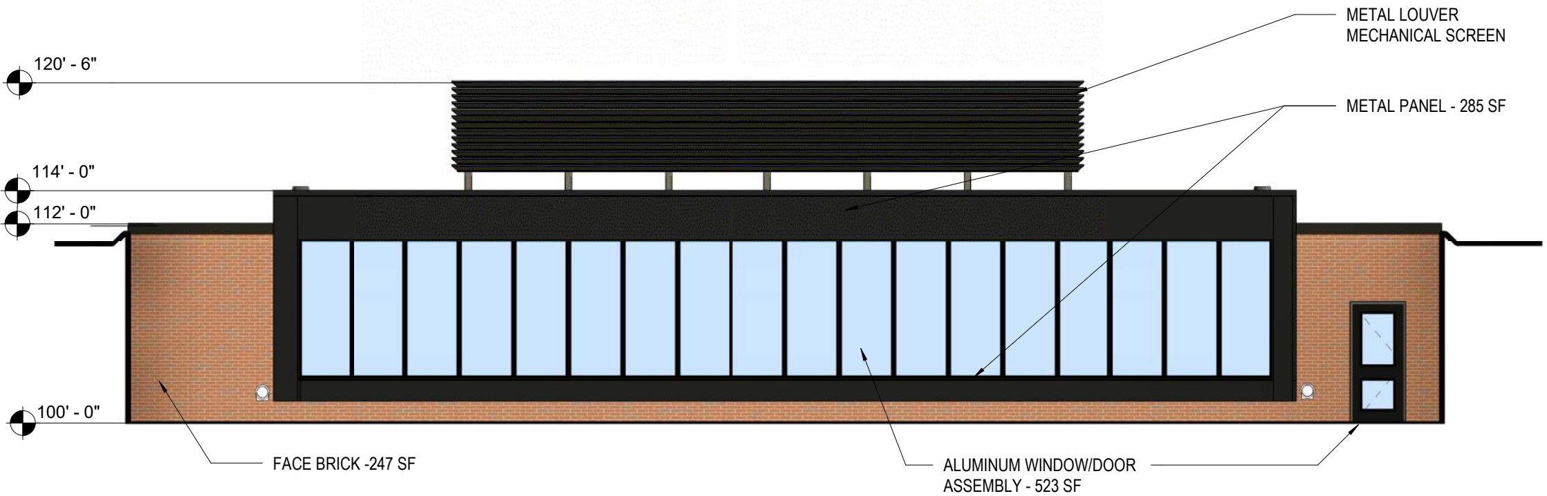
1 EXTERIOR ELEVATION - NORTH. A200 1/8" = 1'-0"