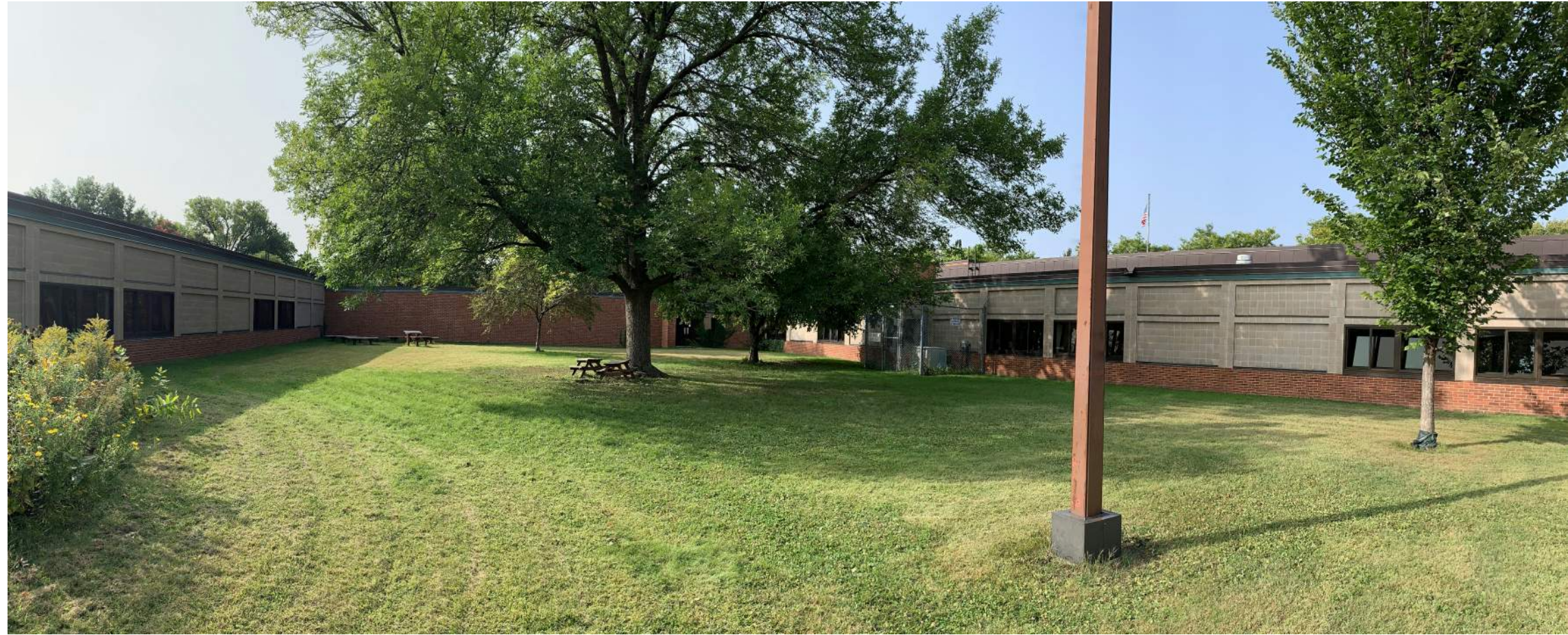
EXISTING NORTH COURTYARD