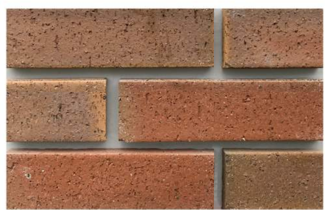
FACE BRICK (EXISTING MATCH)